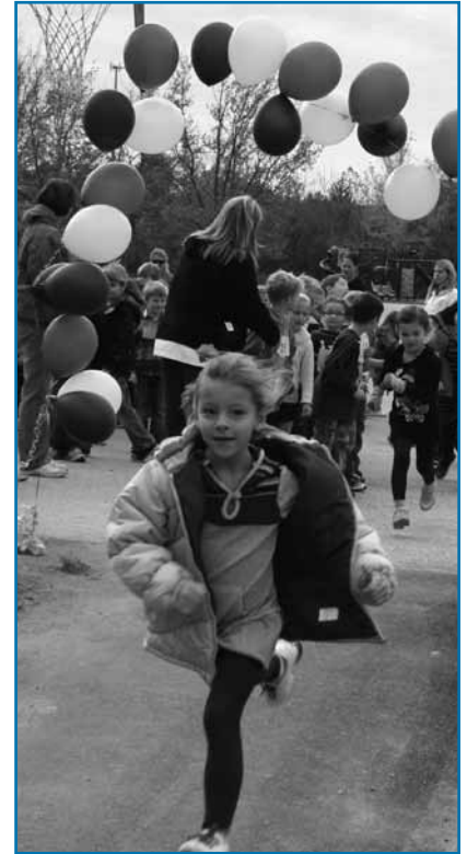
Union Chapel students raced around their school's new fitness track after the grand opening ribbon cutting ceremony.