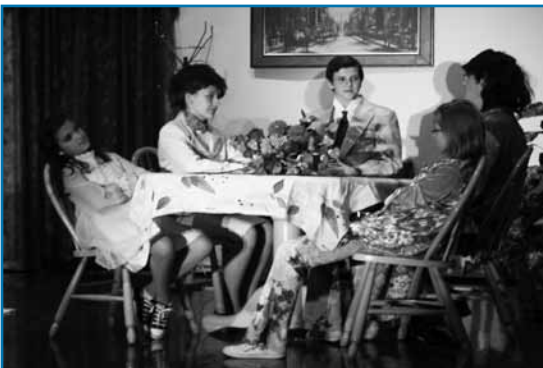
Congress Middle School students rehearsed for their fall play, Sunrise Boulevard.