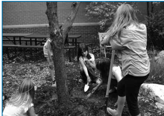
The Prairie Point Gardening Club introduces students to different types of gardening, healthy living and taking care of the environment.