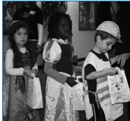
Gerner Center students dressed up in Halloween costumes and walked through the school to gather treats.