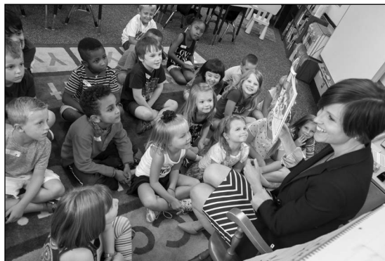
Enroll your incoming kindergartner now, and mark your calendar for the Kindergarten Roundup event at your child's school on May 9.

Families with children entering kindergarten in the Park Hill School District in August 2016 may enroll now by visiting their local elementary schools between 7:45 a.m. and 4 p.m., Monday through Friday.